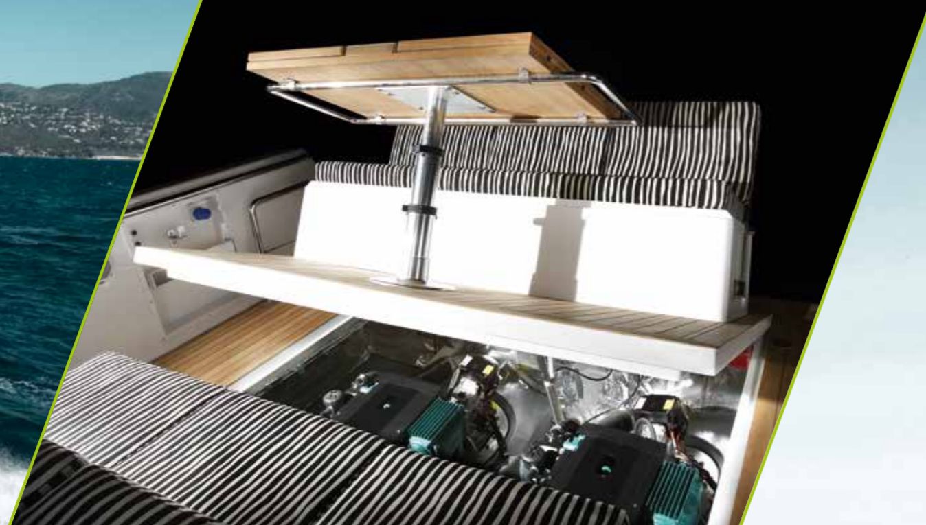
power for propulsion: two Volvo IPS engines with 370 hp or 435 hp