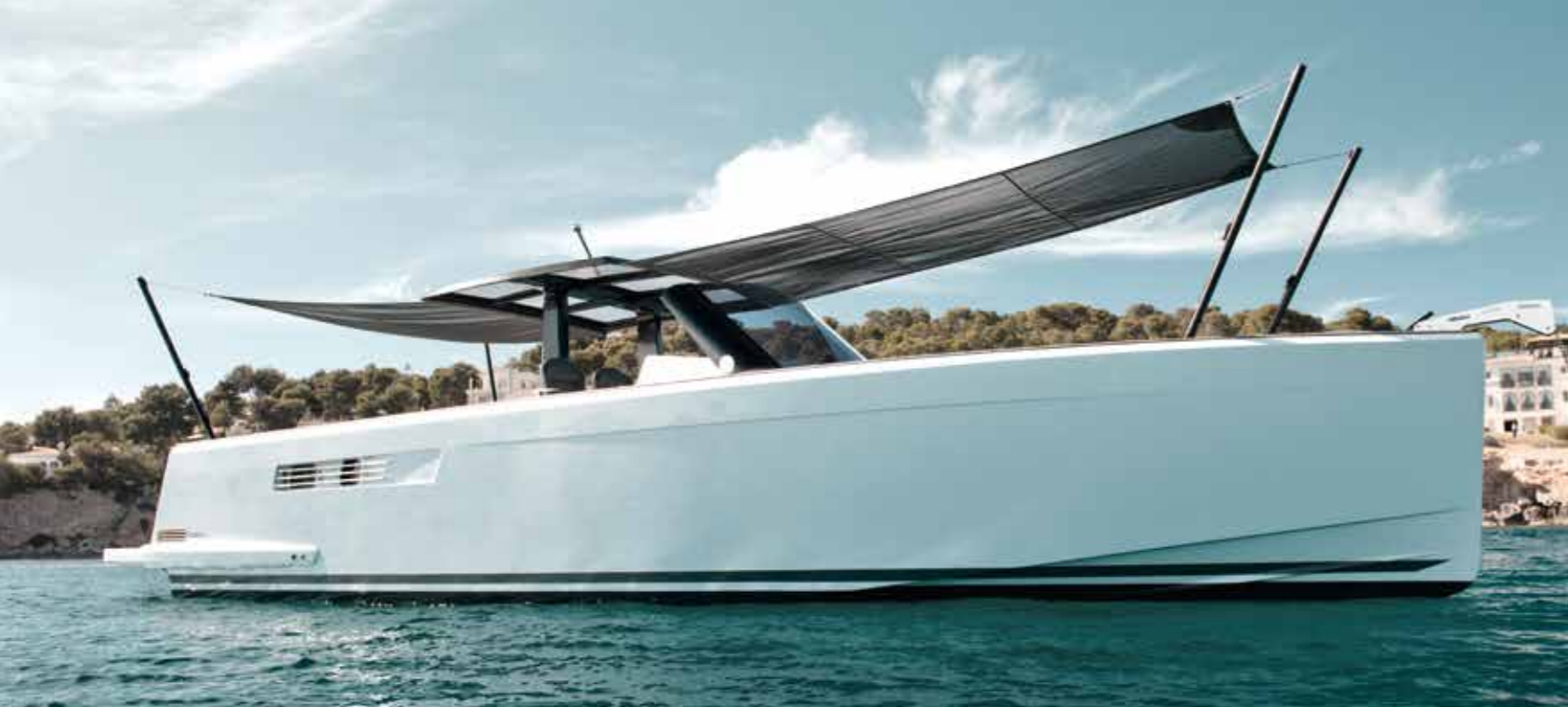
set up in a matter of seconds: bimini sunshade for foredeck and aft