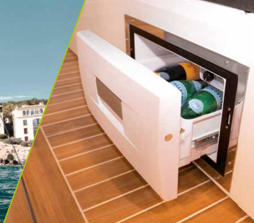
discreet luxury: refrigerator under the seats