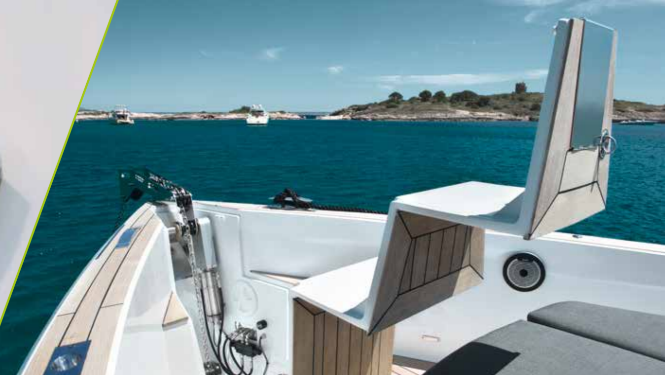
very comfortable: hydraulic anchor arm