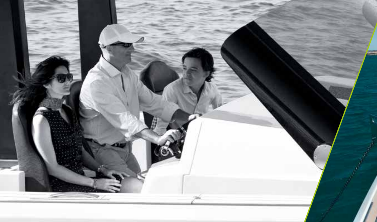
easy to use: the electric anchor