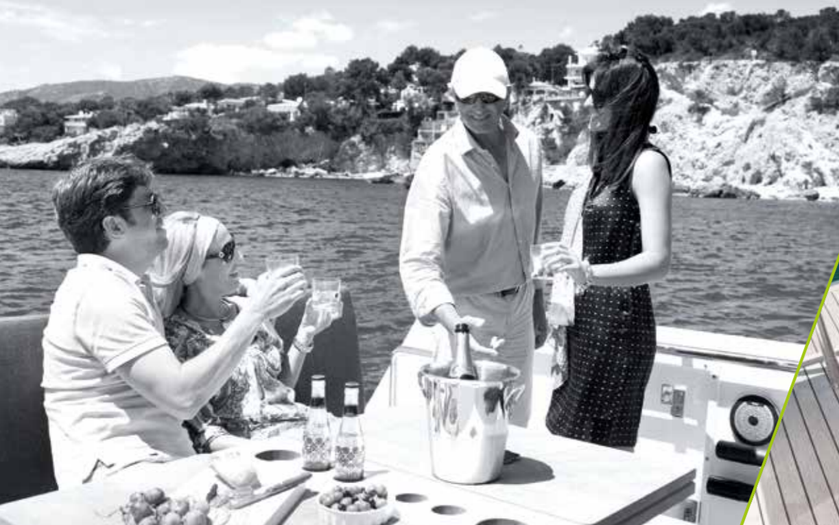
spacious deck: for family and friends, for having lunch or a sunbath