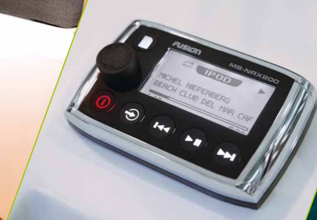
audio control station: perfect sound from anywhere